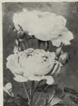
Paul's Scarlet Climber

VIOLETTE —Rather large flowers of deep reddish violet borne in big trusses on a strong slender-caned plant.